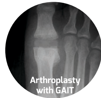
Arthroplasty with GAIT